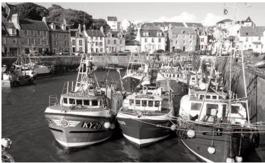
Pittenweem, Fife: Scotland's fisheries have been annihilated by the European Union.

simply involved in promoting a delusion. On the one hand they introduce backward political division and on the other they enable sources of national wealth to be broken up into bite size chunks to be acquired and bled white by private monopoly.