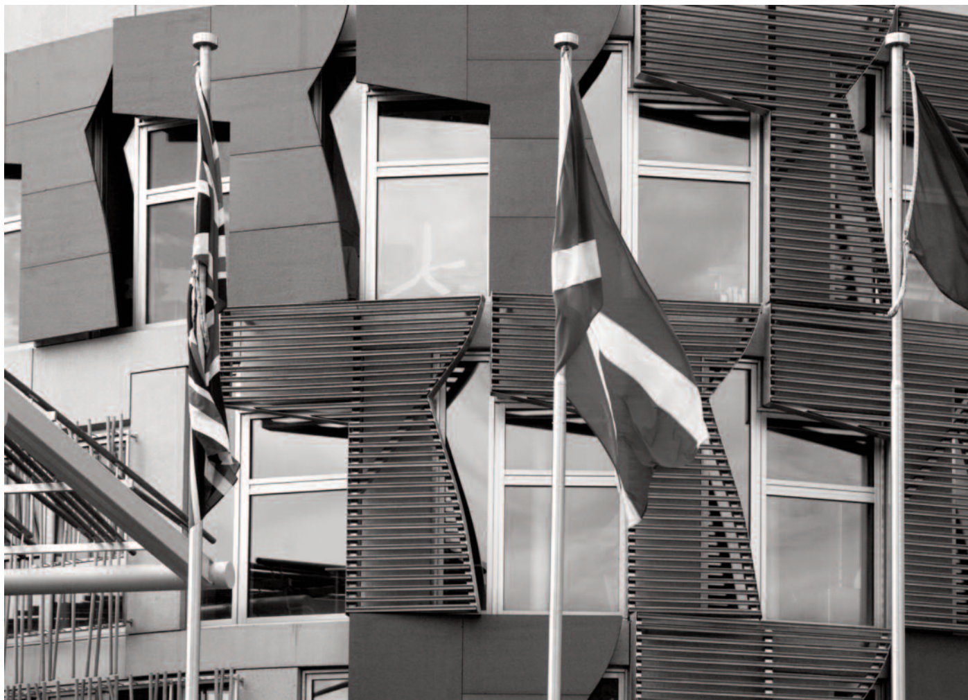
The Scottish Parliament in Edinburgh – flying not just the UK and Scottish flags but also that of the European Union.

THE SCOTTISH referendum is a false flag operation. It is an attempt to turn the growing desire in Britain to be an independent country into its opposite, for Britain to be partitioned instead.