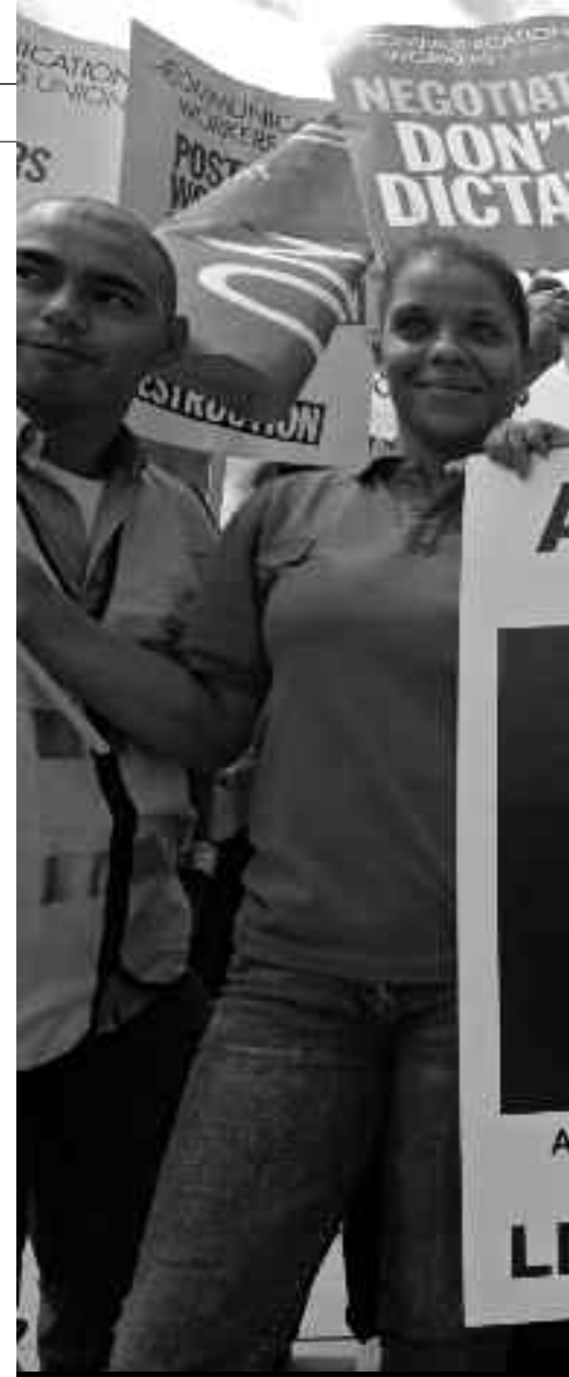
Taking the initiative, and refusing to be dictated

Keynes is often described as a liberal, but calling for "a different system" doesn't