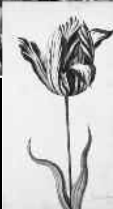
Above: Tulip field, the Netherlands. Right, 17th-century painting of the Semper Augustus, the most expensive tulip sold during tulip mania.