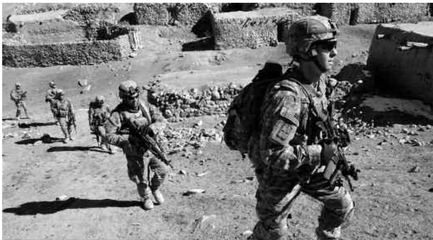
US troops on patrol in Afghanistan, September 2009.

THE BRITISH state's war politics are crumbling under the pressure of reality. The British working class opposes the war: in the recent YouGov poll, 73 per cent want troops to be withdrawn from Afghanistan now or within the next year or so. That figure rose to 77 per cent in London. (THE GUARDIAN headlined this as "35% believe troops should come home.")