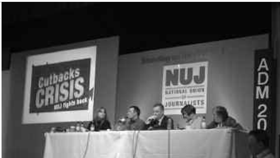
The NUJ conference in Southport this month, where the main themes were resistance to job losses – including via outsourcing and offshoring, the fight for quality, and press freedom. The union also took steps to remain solvent in the face of financial pressure.

Meanwhile, Treasury figures show that British taxpayers are funding child benefit payments of over £20 million for 37,900 children who live in Poland, while one or both of their parents live and work here in Britain. The payouts come despite government assurances that migrants from new EU member states would not immediately be eligible for most benefits.