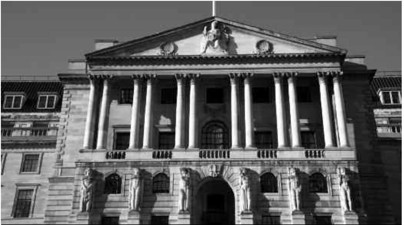
The Bank of England: it was Gordon Brown's faith in the City that led him to take control of the banking system away from it in 1997.

put billions into CLOs. Because the CLOs were not part of a bank, these transactions were all off balance sheet. The credit rating agencies gave CLOs the highest ratings, AAA.