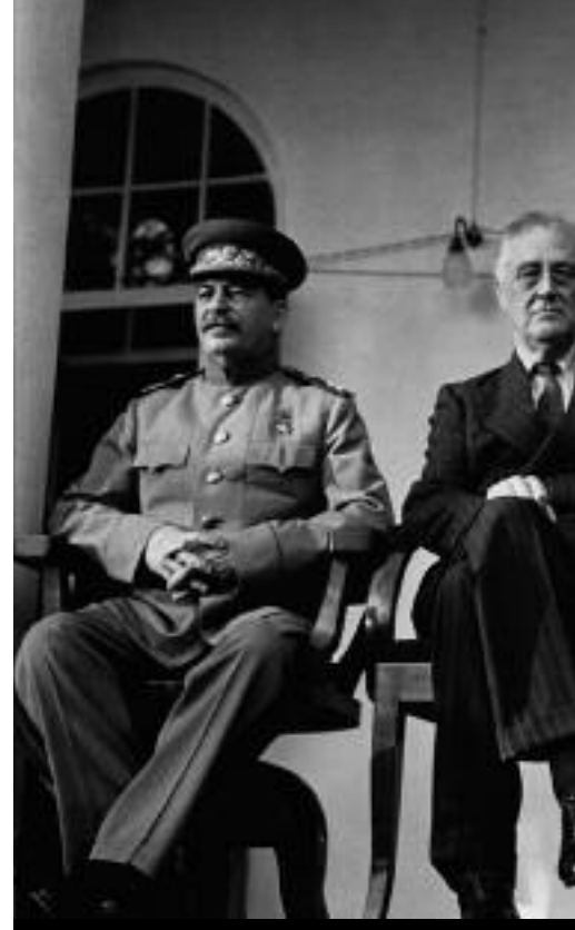
Stalin (left) with Roosevelt and Churchill when t

Furr observes, "In 1939 there were 218,000 Crimean Tartars. That should mean about 22,000 men of military age – about 10% of the population. In 1941, according to contemporary Soviet figures, 20,000 Crimean Tartar soldiers deserted the Red Army. By 1944 20,000 Crimean