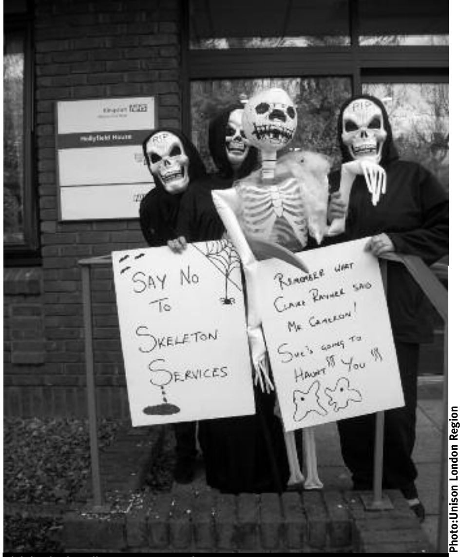
Fighting back: Halloween protest at Kingston Hospital, south London.

The re-establishment of the century's long relationship between "Master and Servant" remains a central goal of the coalition. They are intent on destroying the