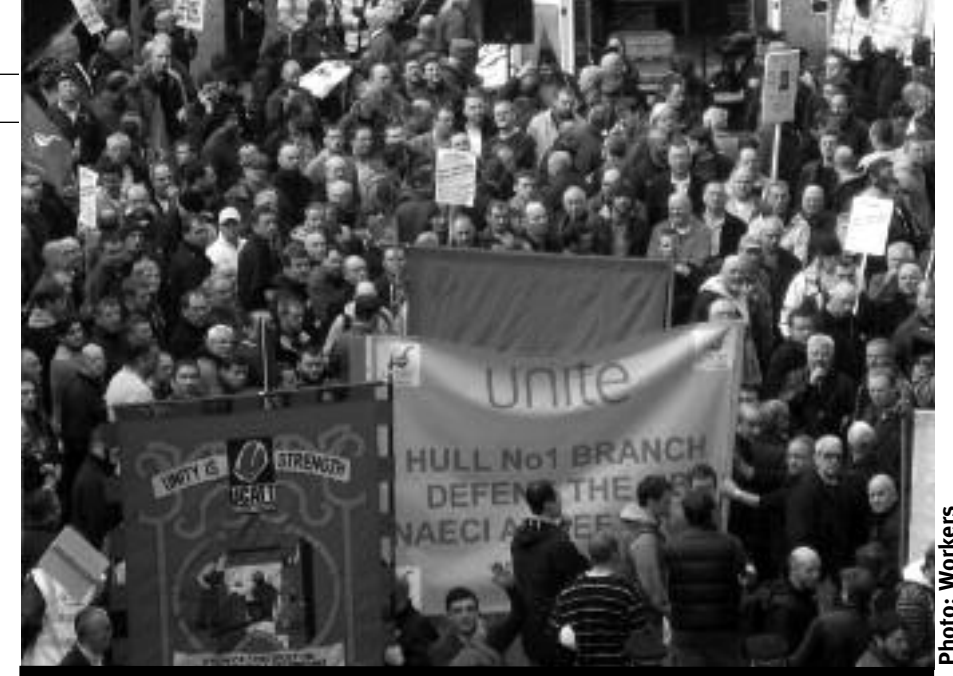
Construction "sparks", members of unions Unite and the GMB, took action on 9 November against attacks on their skills and pay. Above: workers rally at the Shard site in London before marching to the Blackfriars project. Employers Balfour Beatty, Crowne House and others are seeking to deskill the industry.

A VIDEO from 2008 about MEPs has recently gone viral [search Youtube for "expense abuse MEPs"]. It shows MEPs (already very well paid) signing on for daily expenses then leaving for home (some scuttling away from the camera). The accredited reporter was thrown out of the EU Parliament for even daring to question MEPs about that practice.