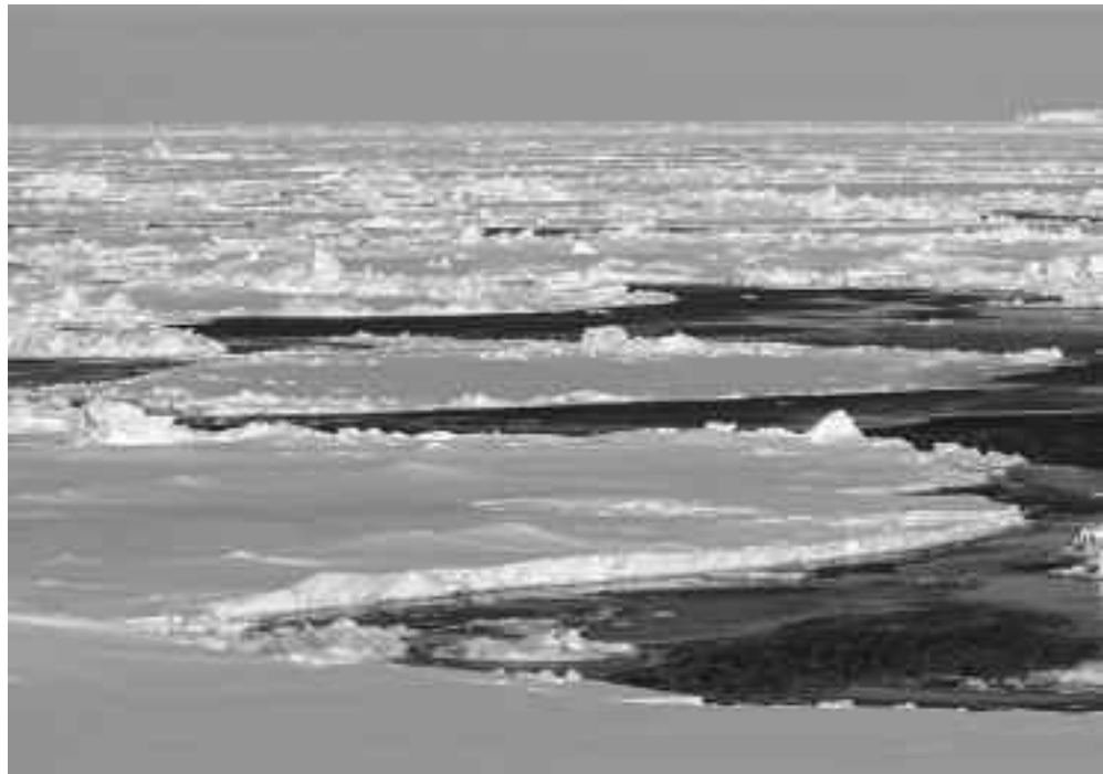
Antarctic pack ice: there appear to be no "statistically significant average trends" in the extent

Every hour, the Sun delivers to the earth as much energy as humans use in a year. The 2004 Symposium of the International Astronomical Union (IAU) concluded that the Sun caused most of the recent episodes of warming. Last century, the Sun's magnetic field doubled in strength, reducing the cosmic rays and so the clouds, thus warming the Earth. The IAU forecast that sunspot activity would