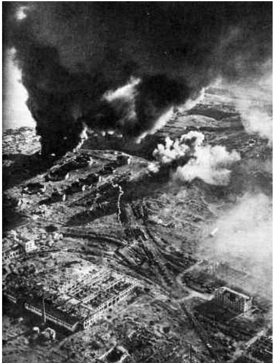
10 January 1943: the battle for Stalingrad rages, but the Nazi army is doomed.

Nazi Germany and the Soviet Union in June 1941, Stalingrad – as in 1918 – assumed a special strategic importance. Launching an attack on 23 August, the armies of Von Bock and Von Paulus knew they had four months in which to take the city before winter set in. Through a combination of guerrilla raids, of fortifications manned by a workers' militia