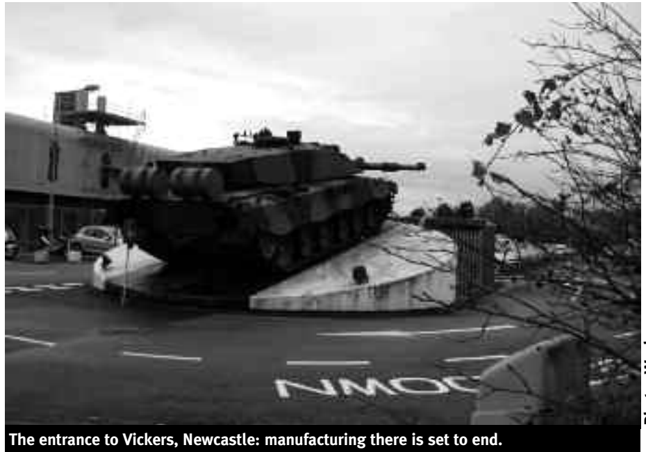
The entrance to Vickers, Newcastle: manufacturing there is set to end.

EUROPEAN foreign ministers have found they no longer get to take part in EU summits of heads of state and government. The new EU Foreign Minister, Cathy Ashton, goes in their place. Since the Lisbon Treaty came into force, relations between member states are now considered "domestic policy".