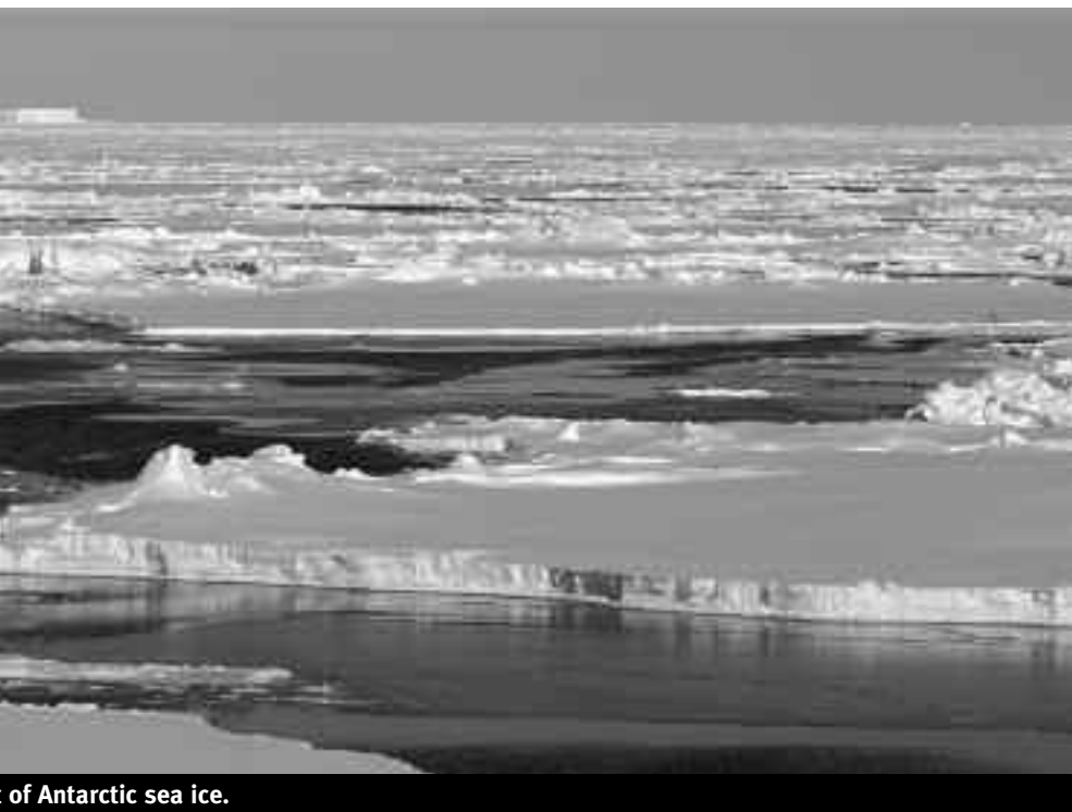
of Antarctic sea ice.