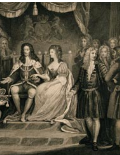
own of England.

Ways of thinking had changed too. For the first time the nature of wealth was explained as a product of work – well before Adam Smith in the 18th century and Karl Marx in the 19th.