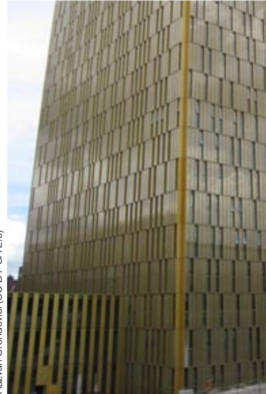
Razvan Orendovici (CC BY-SA 2.0)

It's not just the unskilled. Without free movement how could the government have erected the massive tuition fees barrier to the training of nurses, midwives and other health professionals while understaffing runs