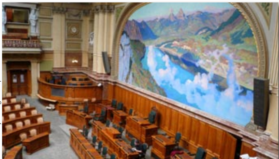
Walters-Storyk Design Group