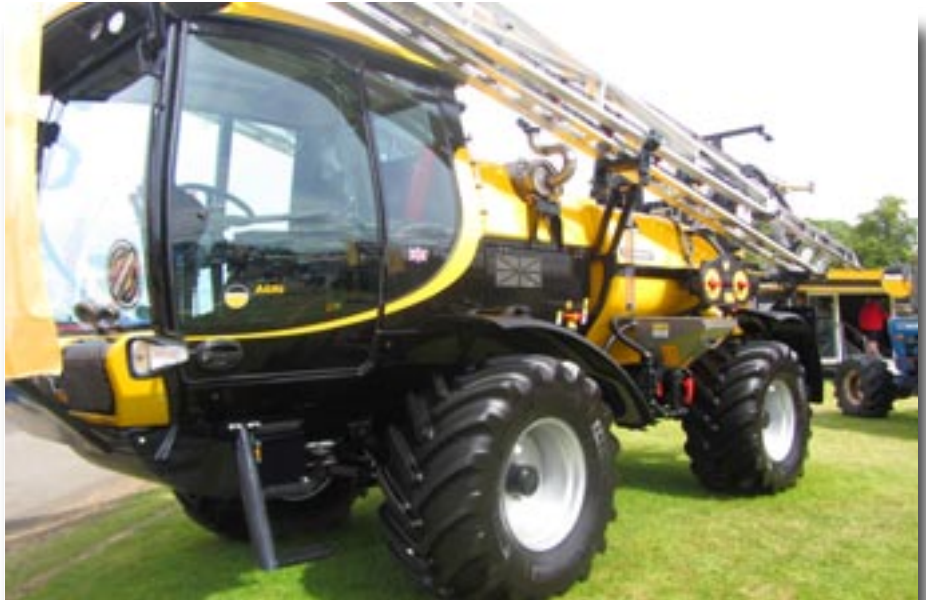
Made in Britain: the McConnel Agribuggy sprayer seen at the Royal Highland Show, Edinburgh, June 2019.