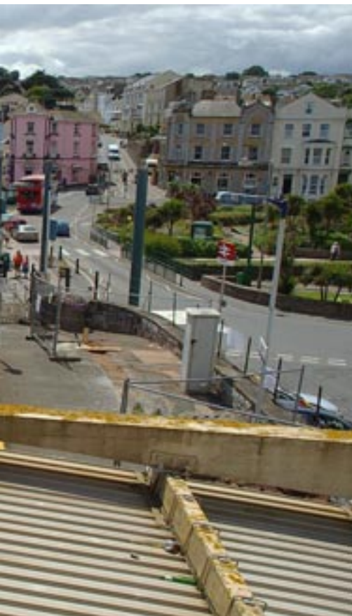
... now 22 of the 125s are in storage, replaced by ... when seas are high, unlike the 125s!

partners for the franchise replacement, which includes running the first trains over the new HS2 route. Virgin, Stagecoach and their new French state partner SNCF are currently pursuing a legal claim against the DfT, as is Stagecoach over the East Midlands franchise.