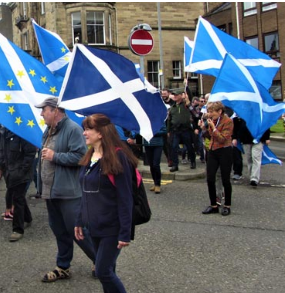
claimed 5,000 were there – seemingly unaware of the irony of diluting the deep blue saltire with

making a modest but steady recovery from the downturn that began in 2014. Exploration is gathering pace again, with prospects of up to 20 billion barrels of oil and gas still available.