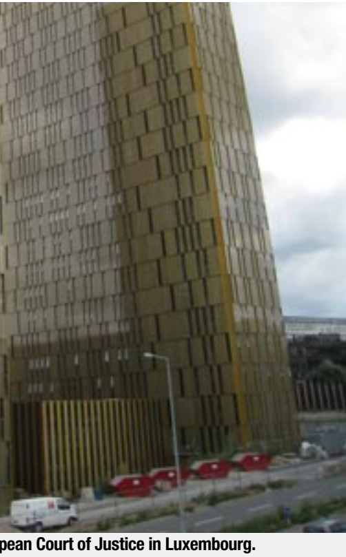
European Court of Justice in Luxembourg.

EU included the proposed requirement for pickets to give their names to the police – an idea that Conservative MP David Davies objected to violently. “What is this? This isn’t Franco’s Britain,” he said, referring to the 40-year fascist dictatorship in Spain.