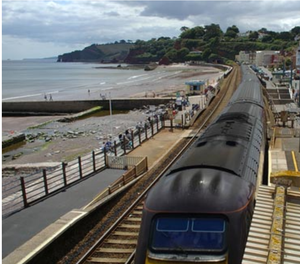
mattbuck (CC BY-SA 2.0)

'No government will be able to return the railways to public ownership without infringing the EU's directives...'