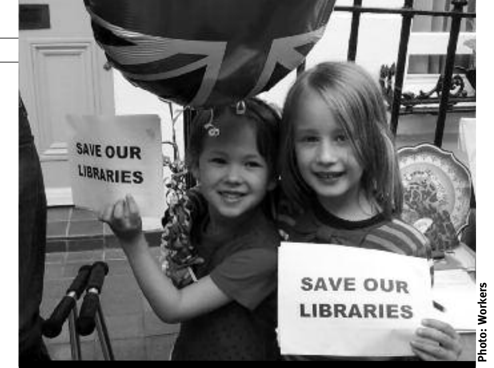
Library users in Camden, north London, took advantage of the Royal Wedding to step up their campaign to save their local libraries from coalition cuts.

MEMBERS OF the European Commission, the European Central Bank and the IMF visited Lisbon this spring, to impose the cuts programmes of the €78 billion bailout. They say that Portugal must accept further deep public spending cuts, privatisation, tax hikes, cuts in workers' rights, and wage bargaining at individual firms rather than industrywide. Outgoing finance minister Teixeira dos Santos says the bail-out will push the country into a two-year recession.