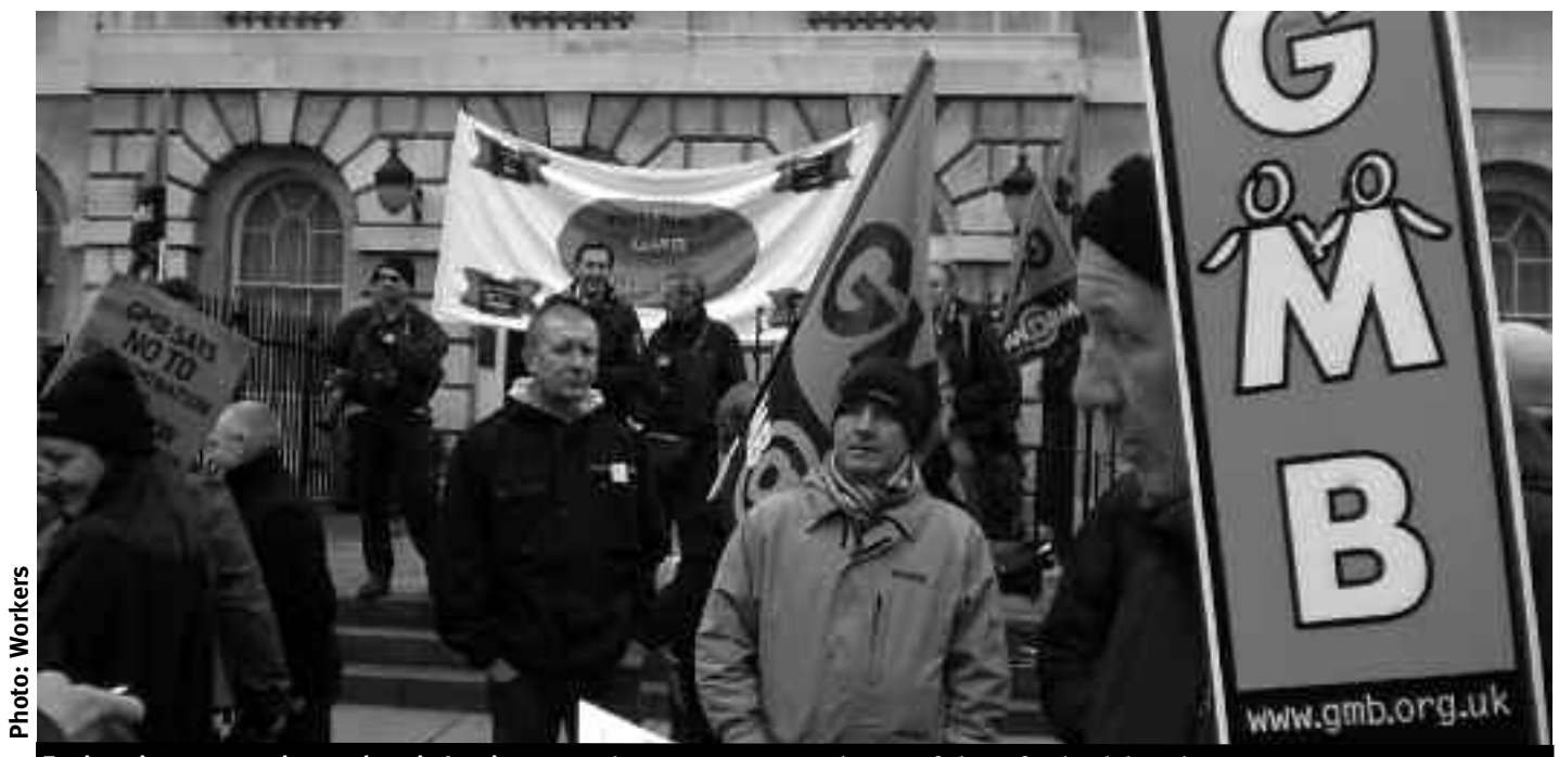
Engineering construction workers in London on 3 February to protest at the use of cheap foreign labour in preference to British workers.

FEBRUARY HAS proved to be a lively month in the engineering construction industry, demonstrating that neither the issues nor the workers will simply go away, despite attempts by "friends" and enemies.