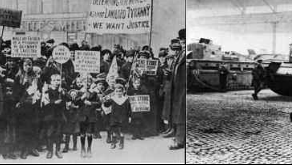
Left: Glasgow rent strike, 1916. Right: three years on, and tanks are stationed in Glasgow on Chi

The only newspaper to report this, FORWARD (with a circulation of over 30,000), was suppressed by the military. The smaller VANGUARD, inspired by Bolshevism, was also closed. Copies of FORWARD were even confiscated from newsagents and regular readers' homes. However, only a week later, the CWC launched its own journal THE WORKER — ORGAN OF WORKERS' COMMITTEES OF SCOTLAND. It ran to five issues before the editorial team and printer were arrested and most jailed for a year. It had featured the