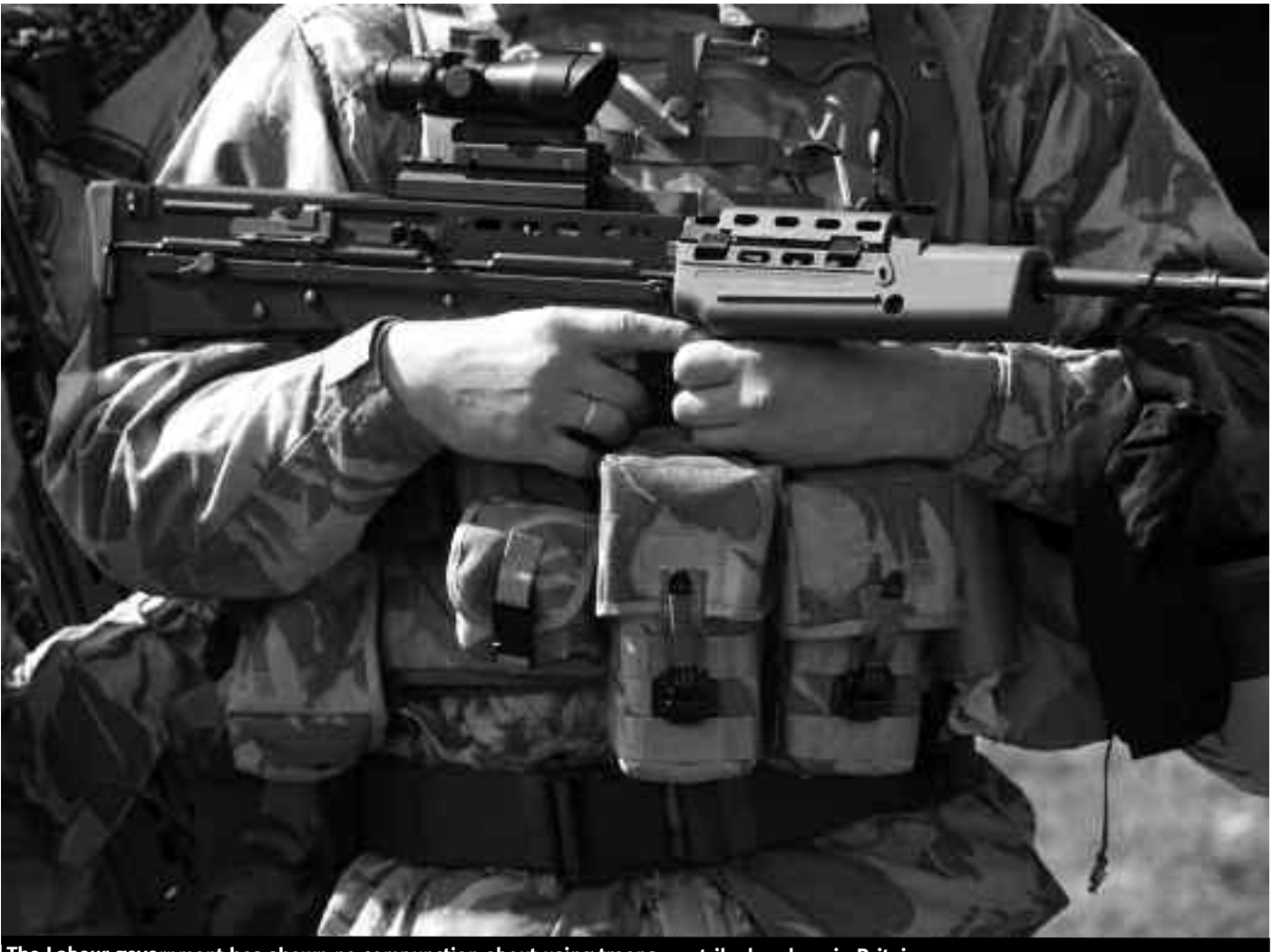
The Labour government has shown no compunction about using troops as strike breakers in Britain.

Falklands 1,200, Brunei 500 and Gibraltar 300. There is also what the Green Paper calls"our classified operations".