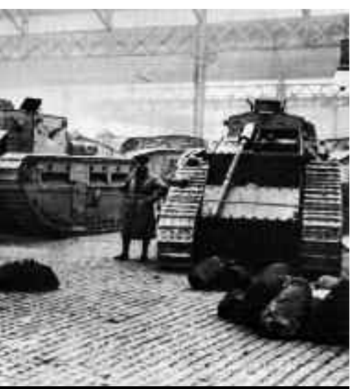
ırchill's orders as mass action grew.

the fear of looming mass unemployment. And there was nothing in the form of a Bolshevik or communist party in Britain at that time to inspire the struggle to go to a more ambitious stage.