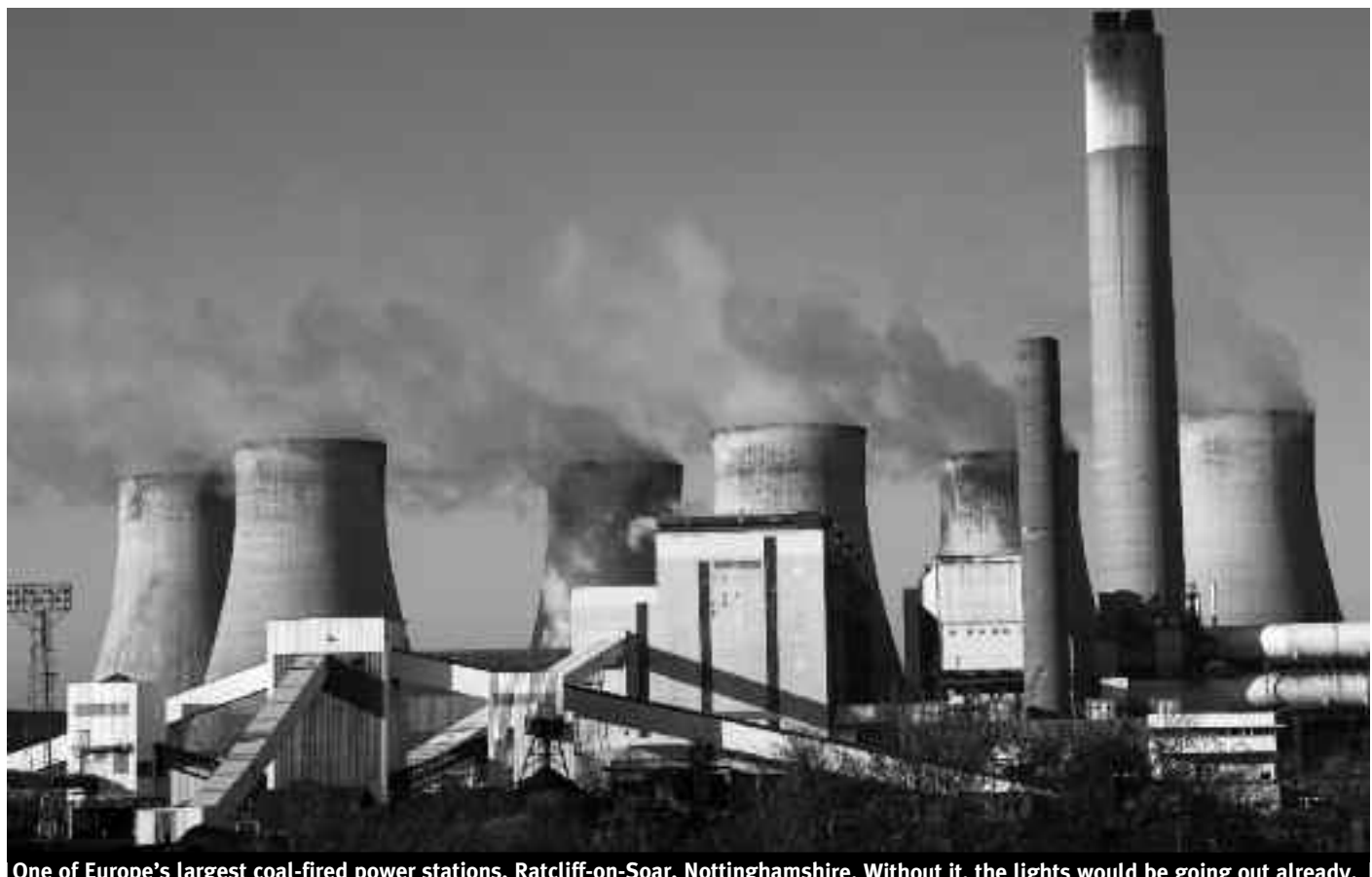
One of Europe's largest coal-fired power stations, Ratcliff-on-Soar, Nottinghamshire. Without it, the lights would be going out already.

coalfields and - with the right level of investment - the only scientifically proved reduction of carbon emission from energy production.