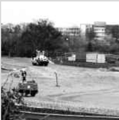
Clearing the Olympic site at Stratford.

CONSTRUCTION WORKERS in the Unite union in London have taken up the fight of the Lindsey oil refinery workers, and calling for trade union control over the hiring of labour at the Olympic site in Stratford, east London. The London and South East Construction Branch also wants direct employment, correct terms and conditions, an end to bogus self-employment, and no blacklisting. The first step is a demonstration called for 6 May from 6.30am onwards at the main gate (see What's On, right).