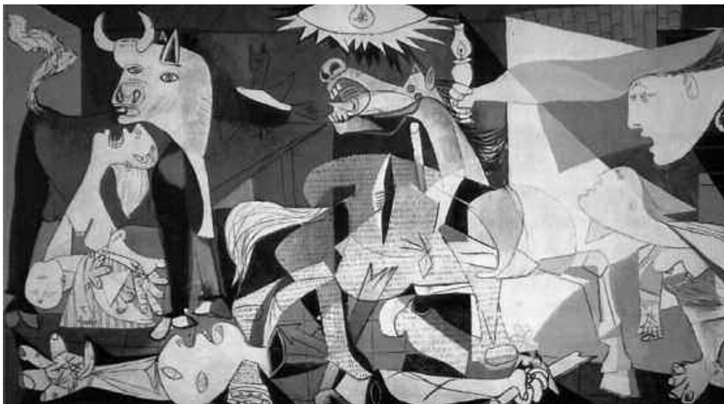
Guernica: the huge canvas is 11 feet tall and 25.6 feet wide.

THE HUGE tapestry reproduction of Picasso's masterpiece GUERNICA , expressing the full horror of the bombing of civilians in the small Spanish town by that name in 1937, was displayed at the Whitechapel Gallery in east London from 5 to 18 April.