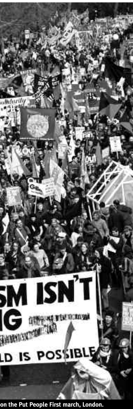
on the Put People First march, London.

carrier being the end point, is re-armament and war being seen as a solution? And anyway, the story ended in March this year when they were all sacked. There's no security with capitalism, above all not in militarism.