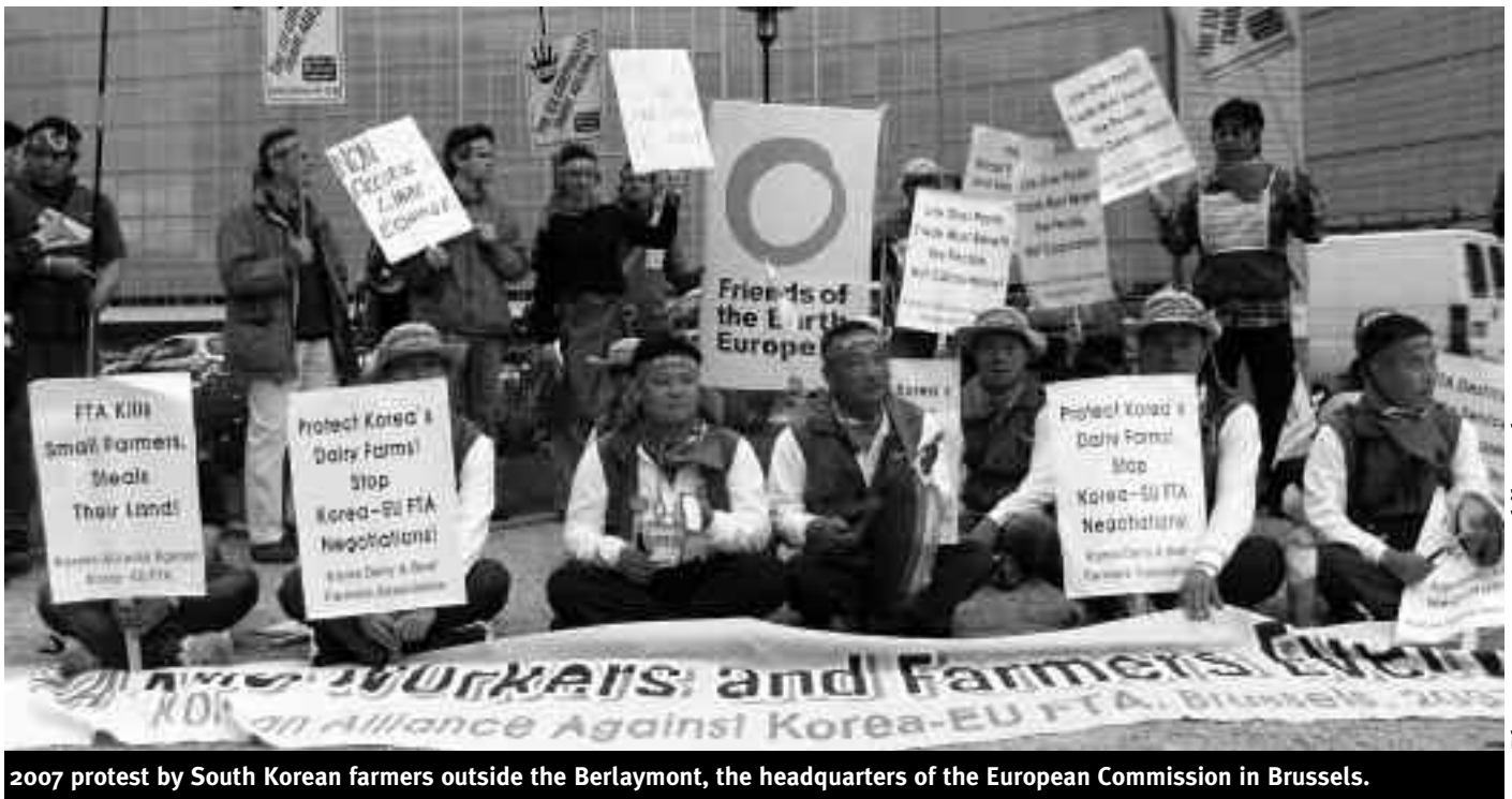
2007 protest by South Korean farmers outside the Berlaymont, the headquarters of the European Commission in Brussels.