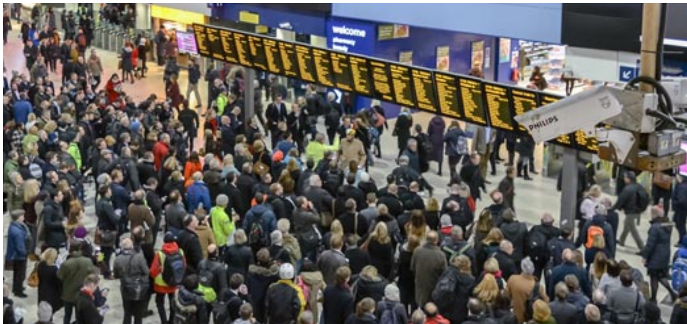
Waiting for a good service: Waterloo Station, London, during the rush hour.