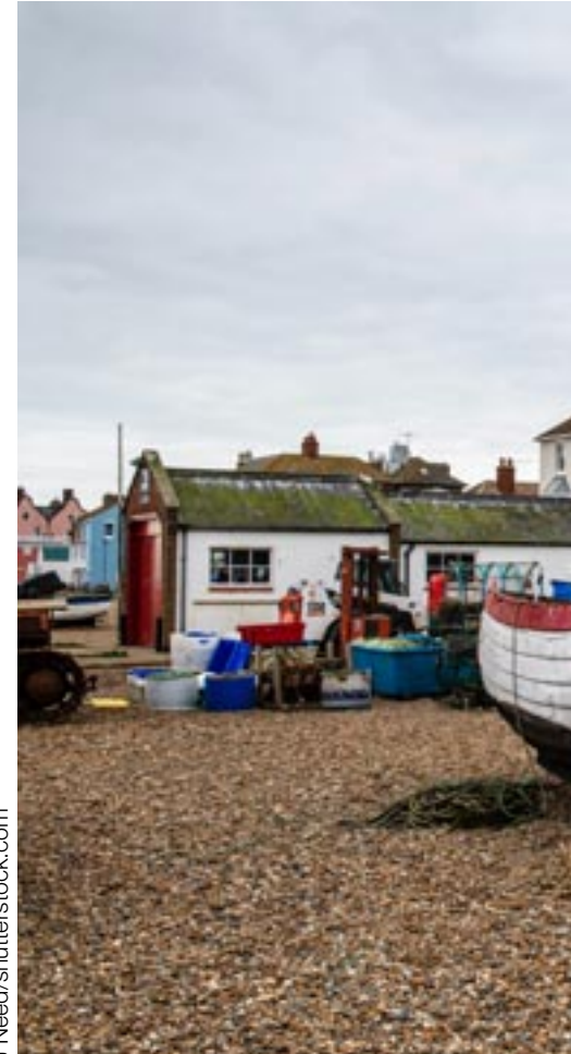
Disused fishing boats beached at Aldeburgh, Suffolk

That is to say nothing of the farming of fish and shellfish, and the rest of the aquaculture industries. Even the pro-EU UK Trade Policy Observatory at the University of Sussex had to admit that the benefits to the UK of leaving the EU's Common Fisheries