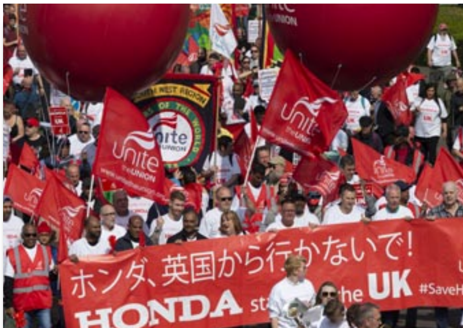
Honda workers marching through Swindon.

They're not getting ready to deal with people queuing for toilet paper. They're getting ready for the civil disturbance that may result from the ruling class keeping us in the EU against our will – which is what enforced membership of a customs union, or repeated extensions of Article 50 would represent. ■