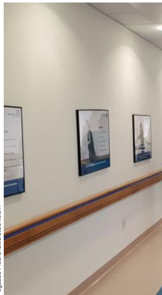
Great Western Hospital, Swindon.

‘Even at its most senior levels, the NHS has tried to bring together those parts that Lansley sundered.’