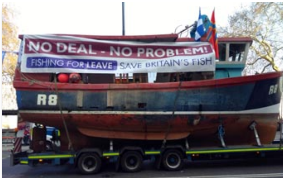
Fishing for Leave brought a boat to Westminster for the 29 March demonstration and rally.