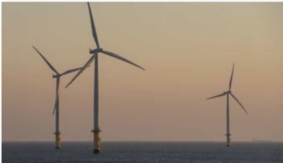
North Sea wind farm off Redcar.