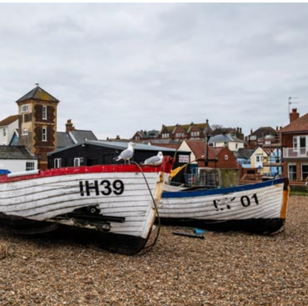
uk, March 2019.

a surplus that our fleet cannot catch, and only at our discretion. It would also be open to us to stop foreign nationals owning British boats and obtaining part of our catch by subterfuge.