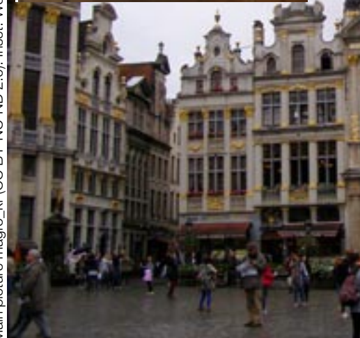
Main picture magro_kr (CC BY-NC-ND 2.0). Inset: Workers

The Manifesto was largely written in the Swan Place, Brussels. Inset, portrait hanging today in the