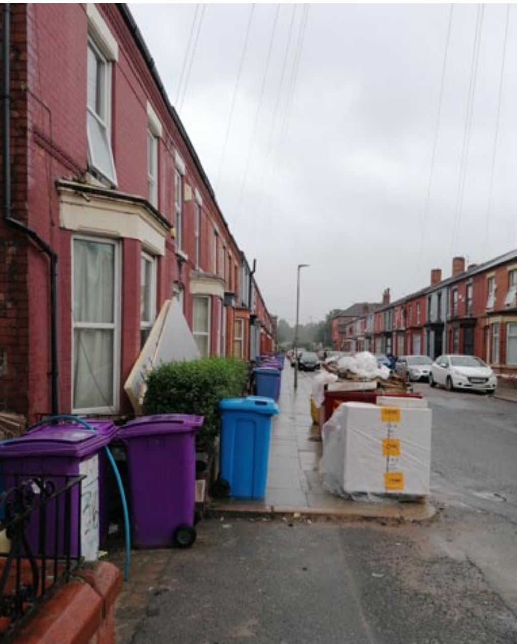
Cranbourne Road, Picton, Liverpool. This picture was taken in September 2021

Picton is a predominately working-class area of Liverpool with a population of just over 17,000 at 2011 census. Like many such areas around the country, it has been changed over the years, through such measures as the sale of council housing by the Thatcher administration in the 1980s, and successive waves of immigration. Yet it has remained largely a cohesive commu-