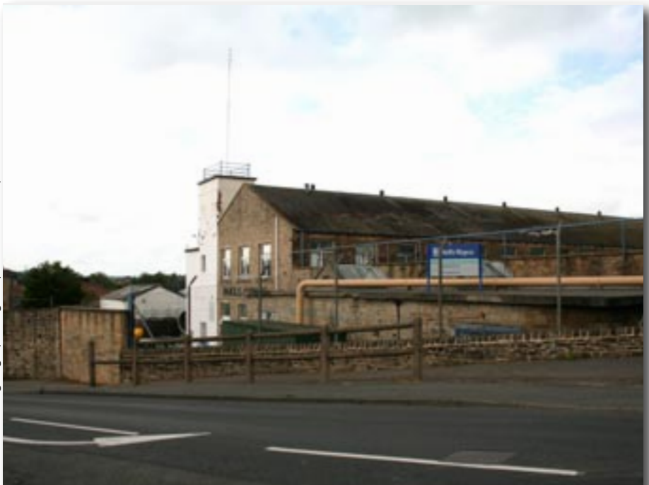
The Rolls-Royce factory in Barnoldswick, Lancashire.