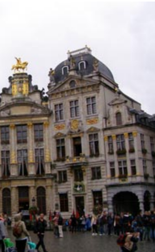
brasserie in the building on the right, on the Grand the brasserie on the ground floor of the building.

is the self-conscious, independent move- ment of the immense majority, in the inter- est of the immense majority.”