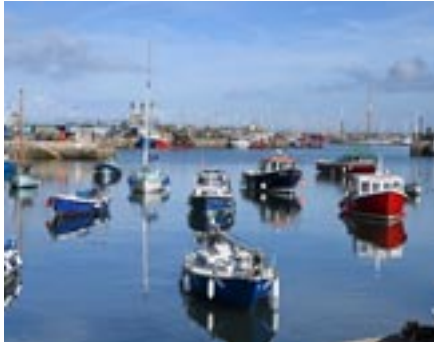
Continued from page 13

formed an alliance with Greenpeace, demanding an immediate ban on super-tractlers in Britain's ten offshore Marine Protected Areas in the English Channel, and a ban on pelagic (deep-sea) trawlers over 55 metres in the entire English Channel and the southern North Sea.