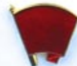
Red Flag badge, £1