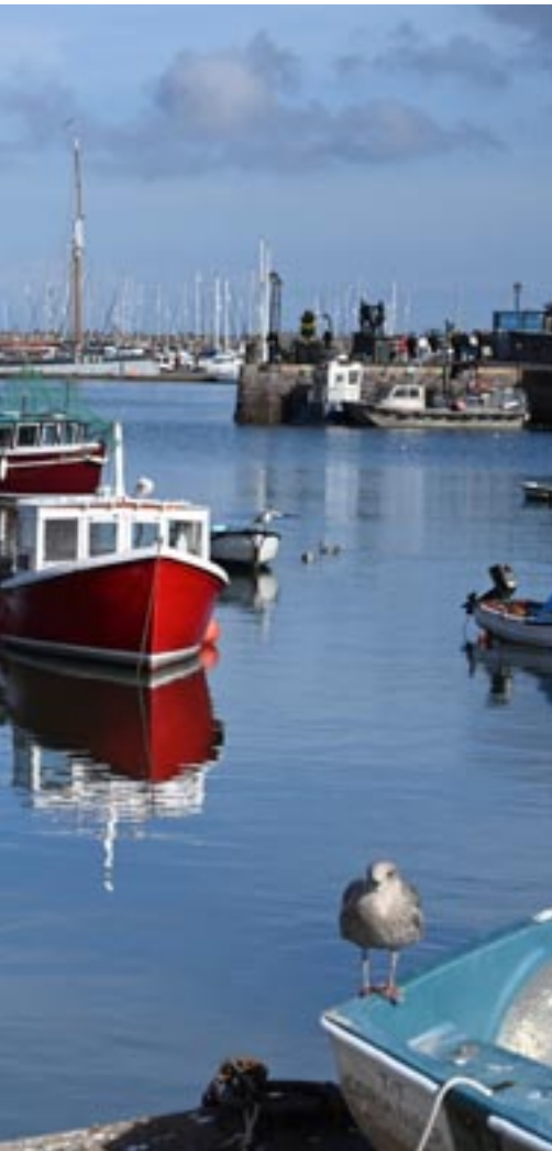
France have clouded the horizon.

on the Law of the Sea, Britain – now that it is out of the EU – has sovereignty over its Exclusive Economic Zone (EEZ). Previously that EEZ was pooled with those of the other EU member states to form “EU waters”. The UN convention states that a “...coastal State shall determine the allowable catch of the living resources in its exclusive economic zone”.