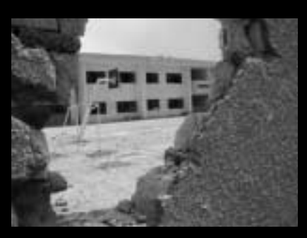
Hitting education: bomb damage to an Iragi school

Texas education consultant Leslye Arsht is advising on the "cleansing" of