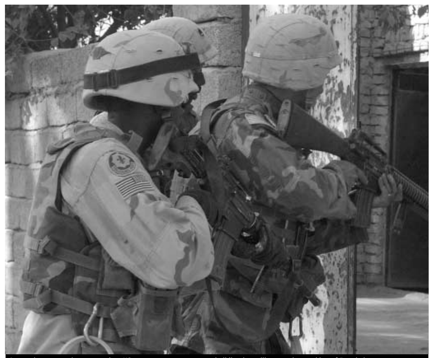
Occupation, occupation, occupation: US troops prepare to enter a building in a village on the outskirts of Baqubah

THE BUSH/BLAIR ATTACK on Iraq ended, officially, on 1 May, with 30,000 Iraqi soldiers, 10,000 Iraqi civilians, 39 British and 138 US soldiers killed. But the US government has 140,000 troops there and is sending another 20,000 troops.