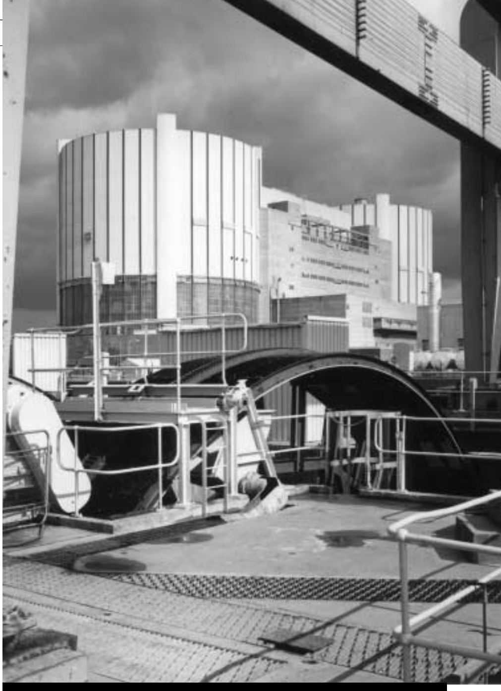
Nuclear technology: Oldbury-on-Severn, one of Britain's Magnox stations

The current mix of electricity is around 32% coal, 23% nuclear, 38% gas, 4% oil and other (hydroelectricity, wind and tidal) 3%. By 2020 gas will account for 80% of generation, with all the problems associated with security of