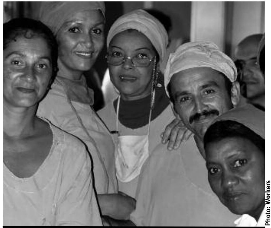
Sovereignty and mutual aid, not debt and dependency: Cuban doctors in Haiti.

The capitalist states and their international financial institutions promote