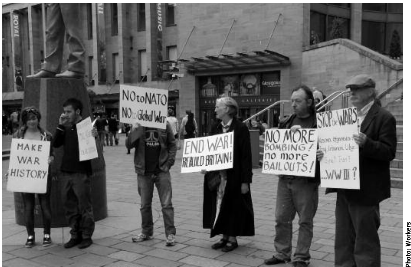
Protestors gather in Glasgow city centre on 8 September for their weekly 5pm Thursday rush hour vigil to condemn the ongoing intervention in Libya and the attack on its sovereignty. Model resolutions are being drawn up to put to trade unions that have not considered the issue yet.

IT'S BEEN involved in the bombing of Libya, in North Africa. In the war in Afghanistan, in Asia. In the break-up of Yugoslavia, in Southern Europe. You wouldn't think, then, that its initials stand for North Atlantic Treaty Organisation. So where did it come from, and why?