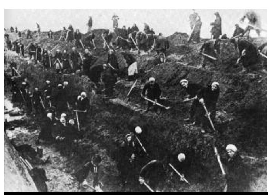
Armed with heavy shovels, Moscow women and elderly men build a tank trap to halt German Panzers advancing on the Russian capital. More than 100,000 citizens worked from mid-October until late November digging ditches and building other obstructions.

The initial advance resulted in two huge encirclements around the towns of Vyzama and Briansk which pocketed 660,000 Russian troops. But by mid-October, the Russian rainy period commenced, turning the roads and countryside into muddy quagmires. The