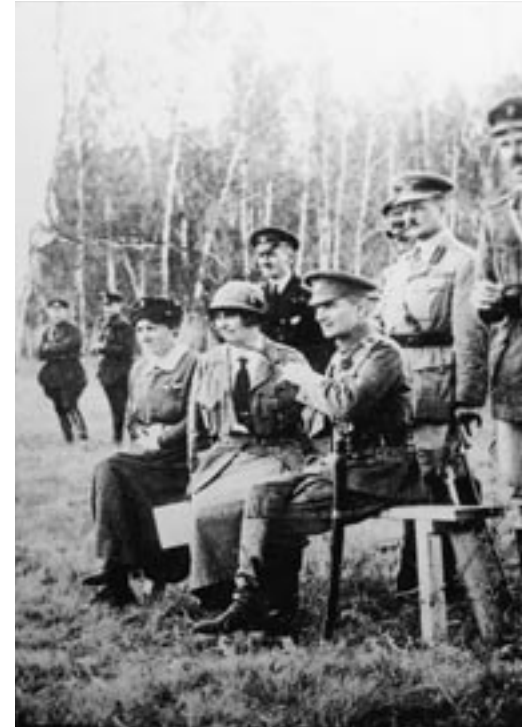
1919, Siberia: White Army leader Admiral Kolchak and British General Alfred Knox, head of the British Mission.

'When the war ended, people questioned why British soldiers were still fighting and dying in Russia....'