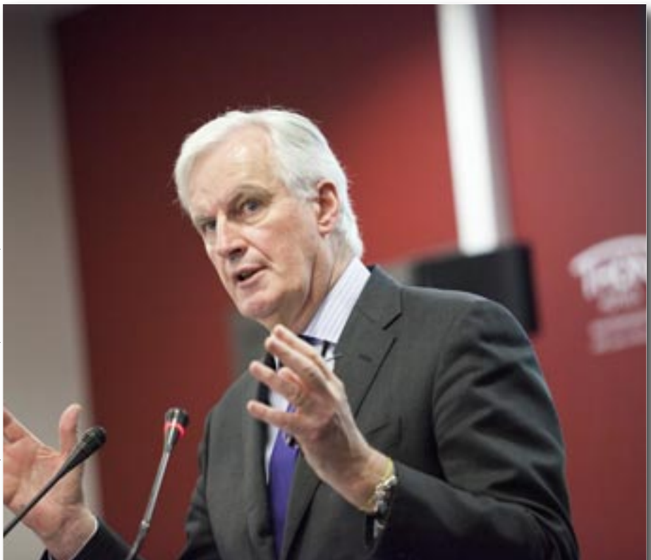
Michel Barnier, conservative French politician and darling of the Remain press, photographed in 2014 when he was European Commissioner for the Internal Market and Services – and pushed for water privatisation.