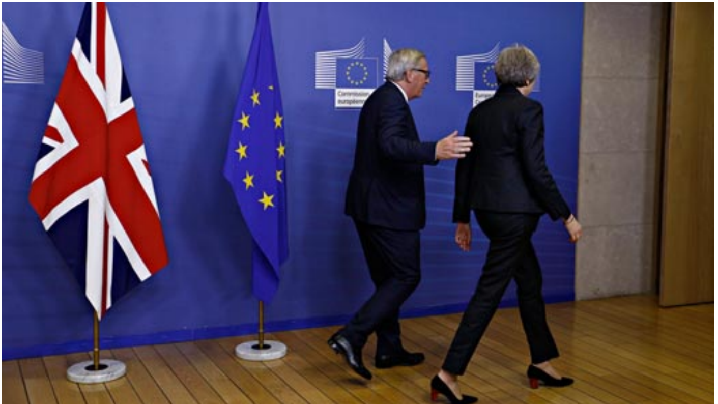
Off you go: Theresa May ushered off the platform by Jean-Claude Juncker, EU Commission president, in Brussels, November 2018.