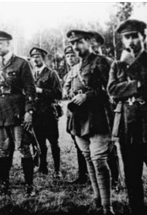
... (seated) observing manoeuvres – and behind ...sion to Russia.

leading establishments and stores of the old army and navy.