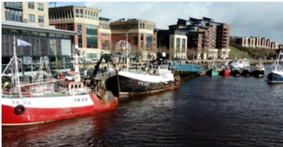
Fishing for Leave flotilla in Newcastle, 15 March 2019.

• A longer version of this article is on the web at www.cpbml.org.uk .