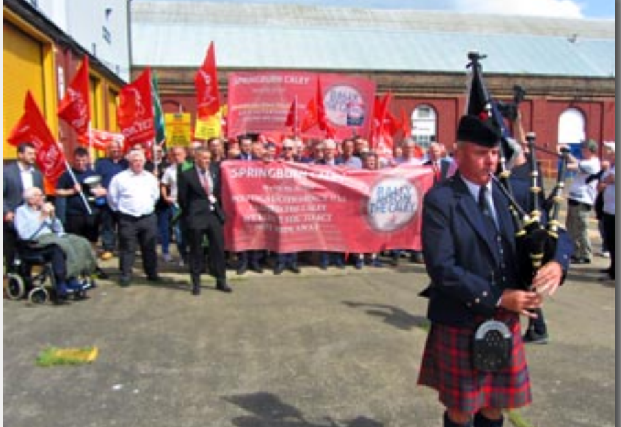
Friday 26 July: workers march out of the factory marking the final closure of the "Caley" rail works in Springburn, Glasgow. The main banner is clearly aimed at the SNP administration.

Visit cpbml.org.uk to sign up to your free regular copy of the CPBML's electronic newsletter, delivered to your email inbox. The sign-up form is at the top of every website page – an email address is all that's required.