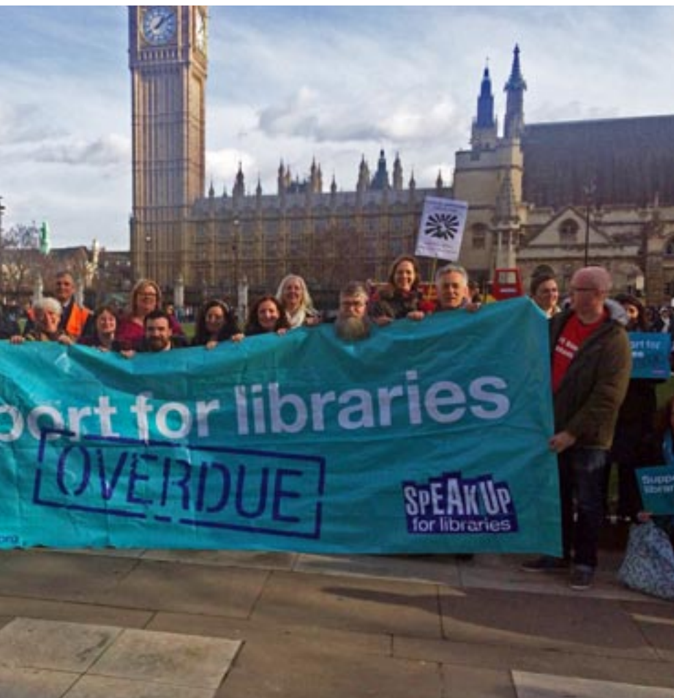
nt, February 2016.

councils of campaigners running libraries themselves, as volunteers. About 500 of Britain's 3,800 libraries are now volunteer-run, often separated from the wider network. Yet evidence suggests that volunteer-run libraries often fail. Initial enthusiasm among volunteers soon fades, they lack the com-