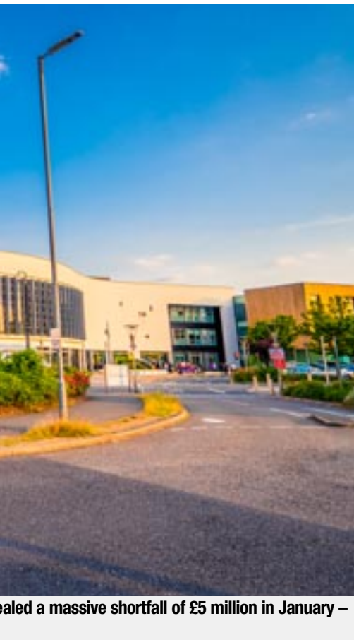
led a massive shortfall of £5 million in January –

College principal Caireen Mitchell says that with a budget of £25.5 million they will have a deficit of £250,000 this year, which means they are unable to offer additional courses in the evenings – they can't afford to open.