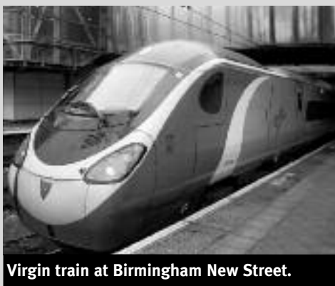
Virgin train at Birmingham New Street.