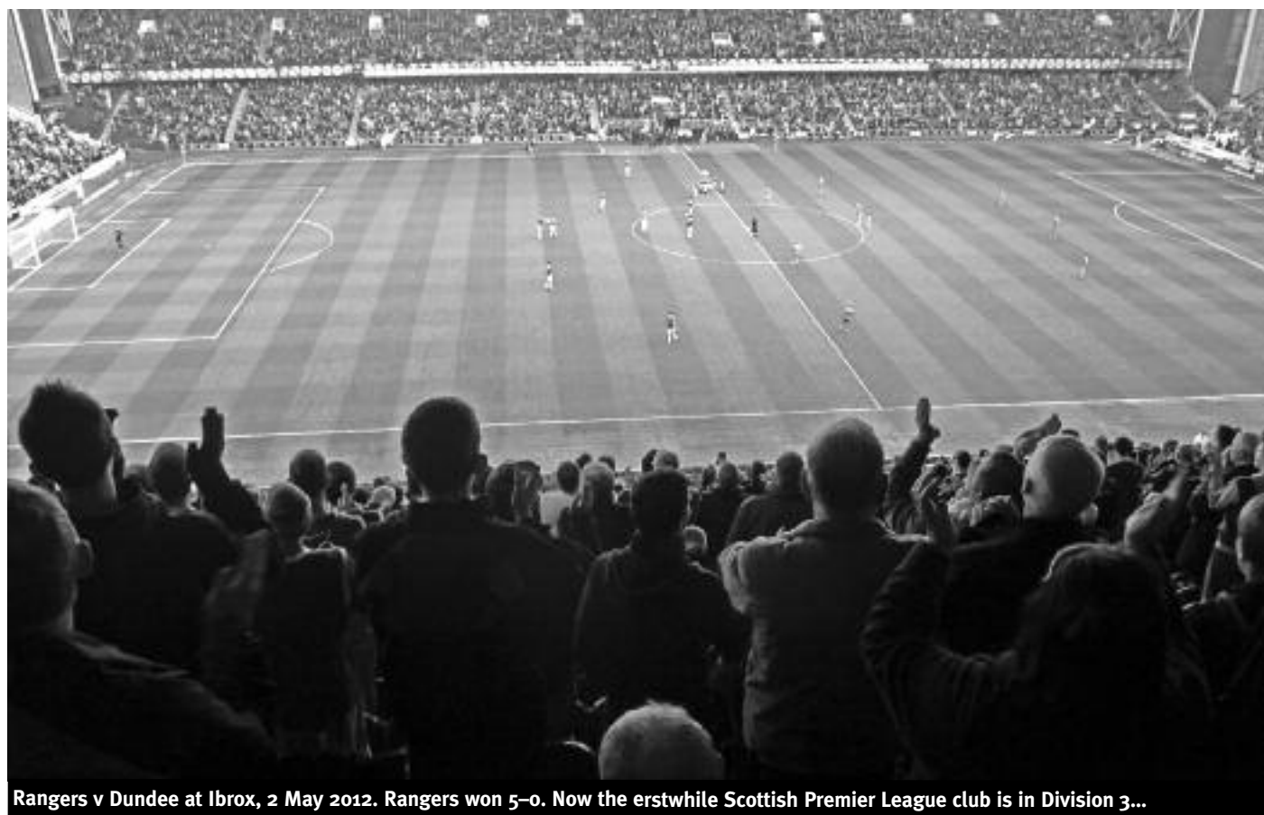
Rangers v Dundee at Ibrox, 2 May 2012. Rangers won 5–0. Now the erstwhile Scottish Premier League club is in Division 3...